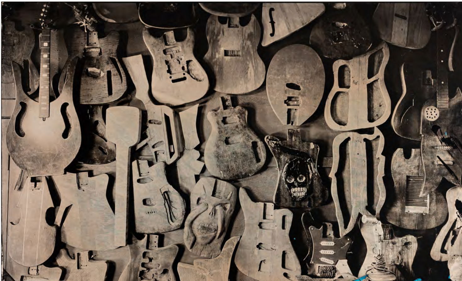
Freeman's Bodies, Tintype, 2018, ©Timothy Duffy

Ultimately, they represent one of the richest and most unique artistic legacies in the United States, regardless of the background of the creators or the subject matter of the work.