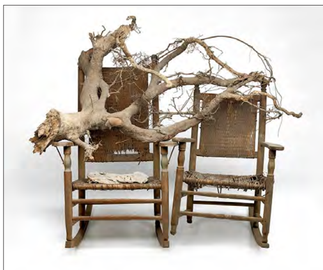
Him and Her Hold the Root, 1994, Lonnie Holley Fine Arts Museums of San Francisco museum purchase American Art Trust Fund and gift of the Souls Grown Deep Foundation

Lonnie Holley is another artist who creates in the tradition shared by Thornton Dial and Freeman Vines. Growing up in the Jim Crow South of the 1950s and 60s, Holley had an unstable and traumatic childhood. He was traded for a bottle of whiskey when he was four. He passed through a succession of caretakers. He was sometimes abandoned and often abused. Holley discovered a calling for art in his late 20s when his sister's two children died in a house fire. She couldn't afford tombstones, so he carved them out of sandstone.